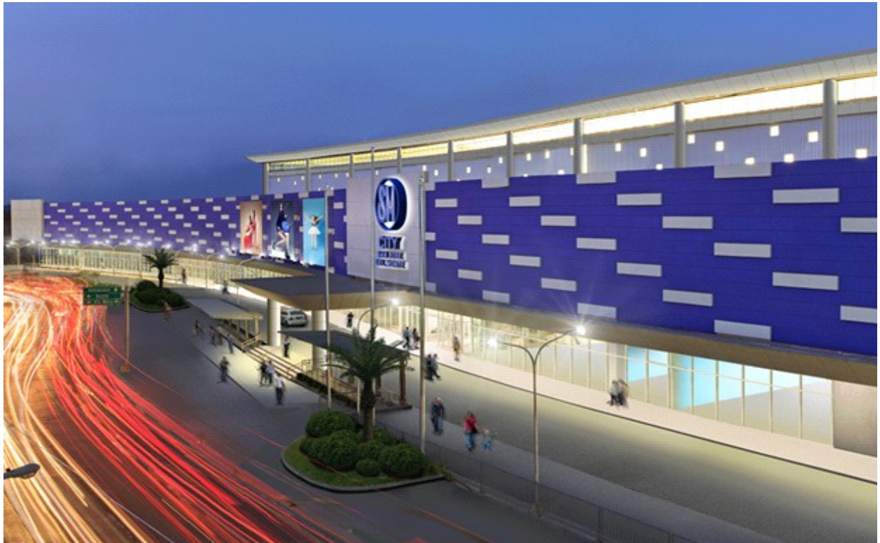
Architect's Perspective of SM City San Jose Del Monte in Bulacan

(28 April 2016, Pasay City, Philippines) SM Prime Holdings, Inc. (SM Prime), the country's largest integrated property company, is opening SM City San Jose Del Monte on April 29, 2016. This is SM Prime's 57th mall in the Philippines and the third in the province of Bulacan – after SM City Baliwag and SM City Marilao.