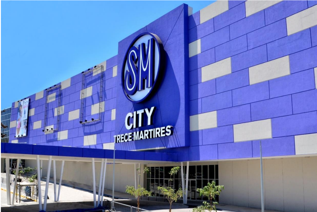
Façade of SM City Trece Martires in Cavite

(12 May 2016, Pasay City, Philippines) SM Prime Holdings, Inc. (SM Prime), one of the leading integrated property companies in Southeast Asia, opens its newest mall, SM City Trece Martires, on May 13, 2016, its 58th in the country. This is also the fifth mall in the province of Cavite after the successes of SM City Bacoor, SM City Dasmariñas, SM City Rosario and SM City Molino.