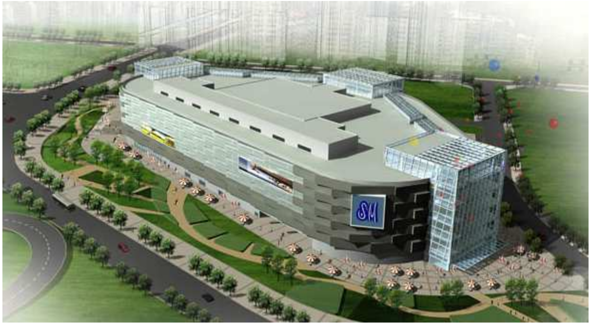
SM City Chongqing

Chongqing has several economic and technological development zones and is a major railway hub. The city also boasts of cultural heritage and natural attractions, and is the starting point for the Yangtze River cruise, which explores the impressive scenery of China's famous Three Gorges.